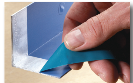
Clean removal, sharp paint edge.